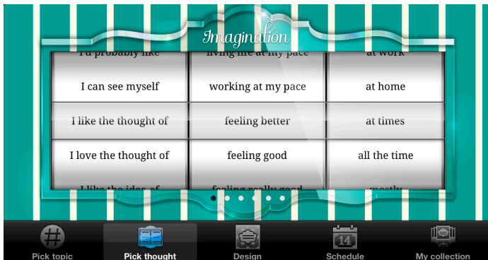
A screenshot from Thoughtful app - 1 of 18 pickers

“We want to encourage people to be picky about what they think, to consciously pick uplifting, soothing and powerful thoughts instead of just thinking on auto-pilot.”